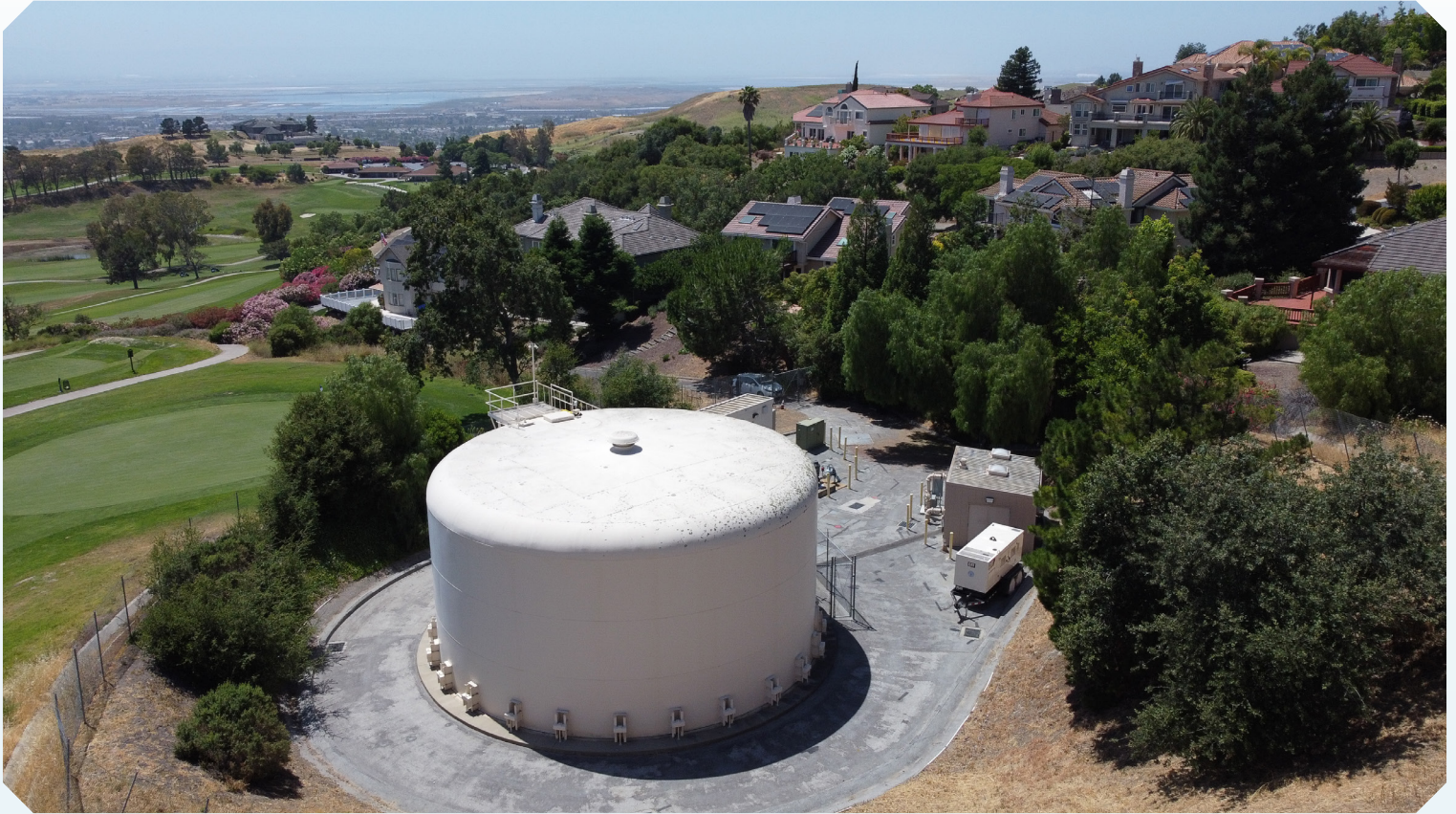
Tularcitos Pump Station - The City's Tularcitos Pump Station pumps and stores water supply to serve residents on the hillside.