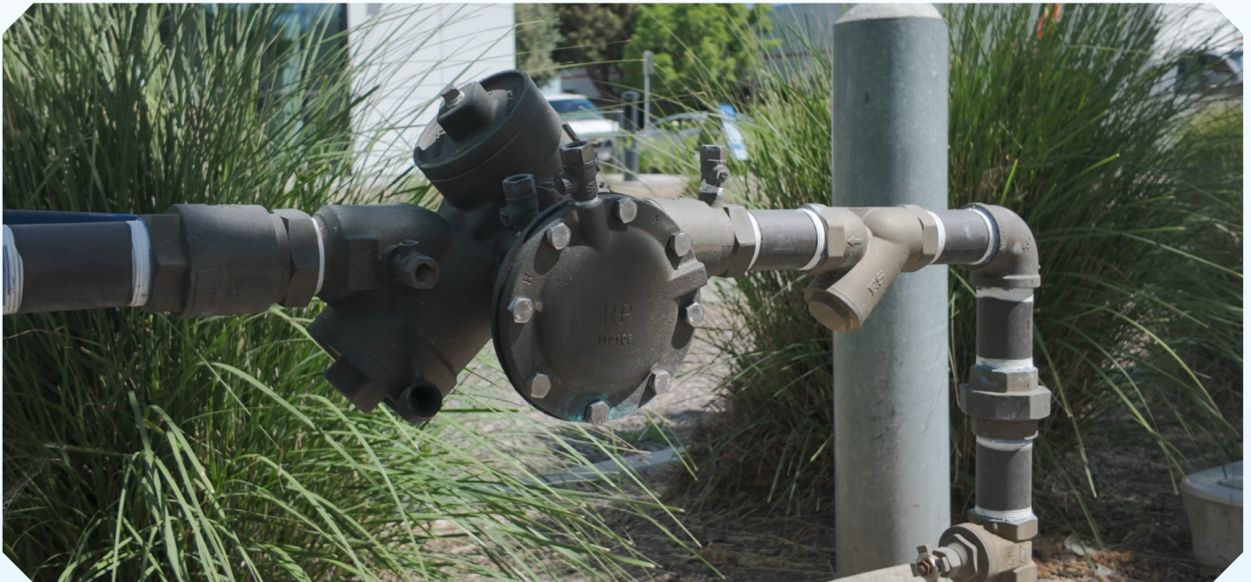
Backflow Prevention Assembly - One of over 2,200 backflow prevention assemblies in the City.

To safeguard our drinking water supply, the City of Milpitas requires high hazard water customers to have a backflow prevention assembly installed on their water service as a protective measure. This helps to preserve the integrity of our water by preventing potential pollutants and contaminants from flowing back into our water supply. The State Water Resources Control Board mandates all water systems to ensure that all backflow prevention assemblies are working as intended, by requiring the inspection and testing of each assembly annually.