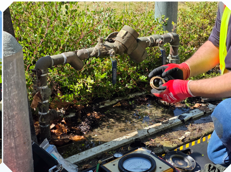
Backflow Prevention Assembly Testing - A Certified Cross-Connection Specialist repairing a City-owned backflow assembly.