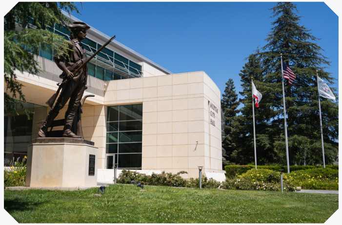
Milpitas City Hall

This report contains important information about your drinking water. Translate it, or speak with someone who understands it. If necessary, please call 408-586-2600 to have the report translated.