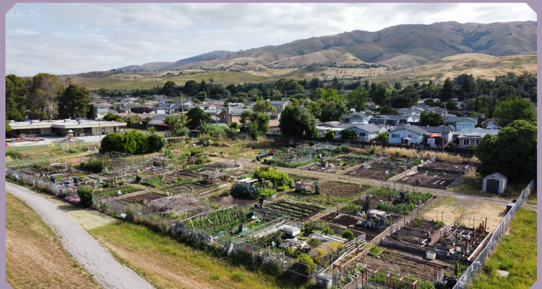
Milpitas Community Garden - Irrigated by recycled water since 2017.

For more information pertaining to recycled water, visit https://www.sanjoseca.gov/your-government/departments-offices/environmental-services/water-utilities/recycled-water .