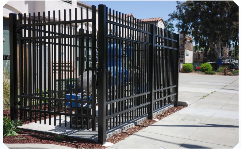
Fire Station No. 1 PRV - FS1 Pressure Reducing Stations Relocation project completed in May 2025.