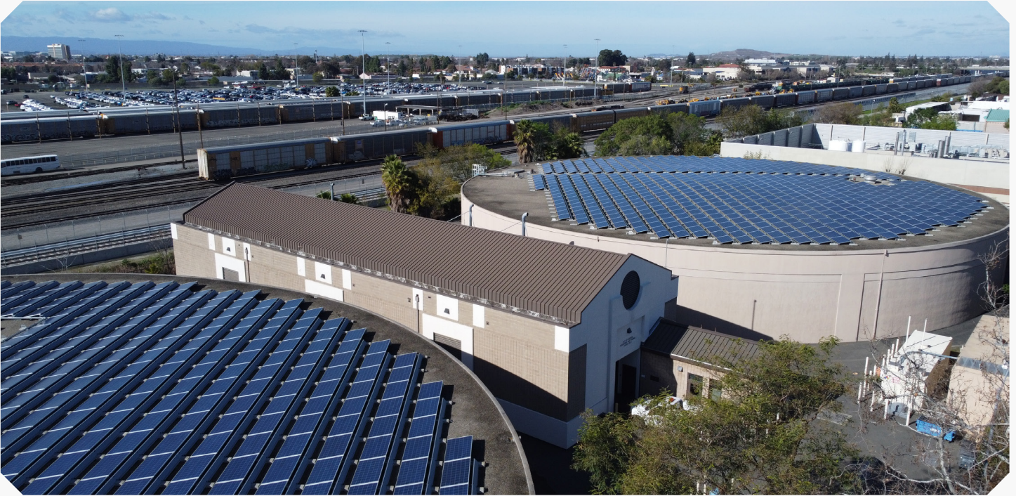
Gibraltar Pump Station/Reservoirs - The City's Gibraltar Water Facility stores, pumps, and regulates the pressure of both SFPUC and Valley Water supplies.

The City of Milpitas draws treated water from two sources that provide clean water to residents and businesses. The water is purchased from two separate wholesalers: (1) treated surface water from the San Francisco Public Utilities Commission (SFPUC) and (2) treated surface water from Valley Water. In the event that water supply is interrupted from either Valley Water or SFPUC, the City has the option of utilizing its emergency groundwater well to meet basic water needs for a short duration of time. In 2024, the City supplied an average of 6.7 million gallons of water per day to approximately 82,000 residents and 1,000 businesses for indoor and outdoor use.