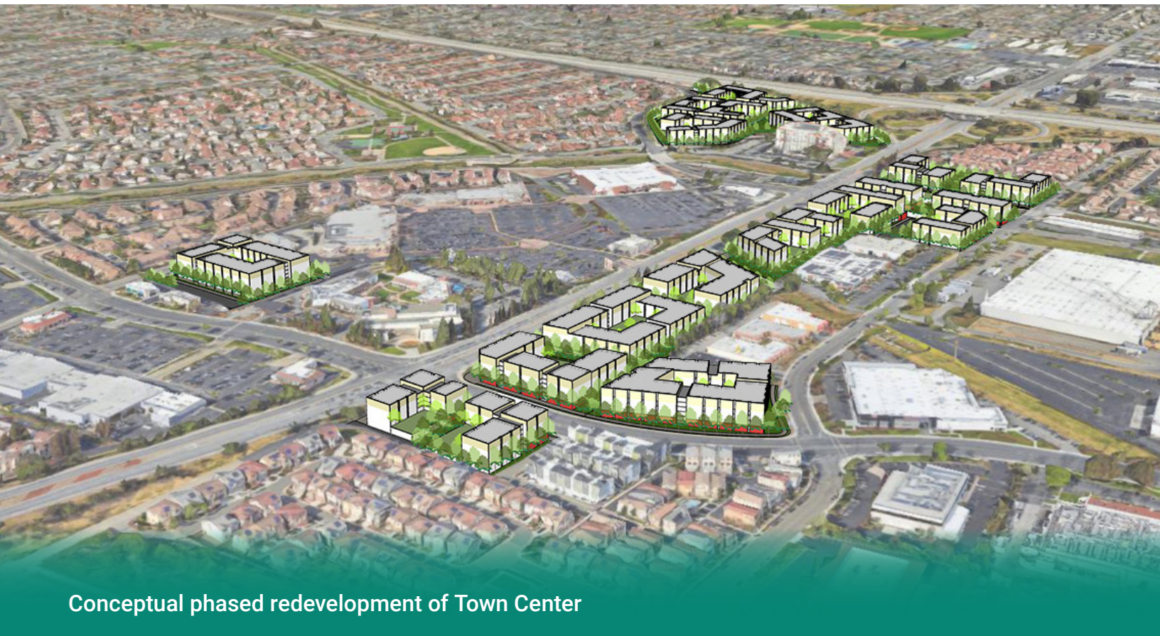
Conceptual phased redevelopment of Town Center

The proposed HOD defines multiple zoning districts within Town Center (TC) that maintain commercial floor area of large shopping centers that are successful and unlikely to redevelop soon. The proposed HOD allows for both horizontal and vertical mix of uses on other parcels. It reduces commercial requirements and adds housing to support redevelopment of parcels South of Calaveras Blvd. The draft HOD also allows residential-only projects on specific parcels. These recommendations implement the General Plan goals of revitalizing aging shopping centers and creating vibrant mixed-use neighborhoods.