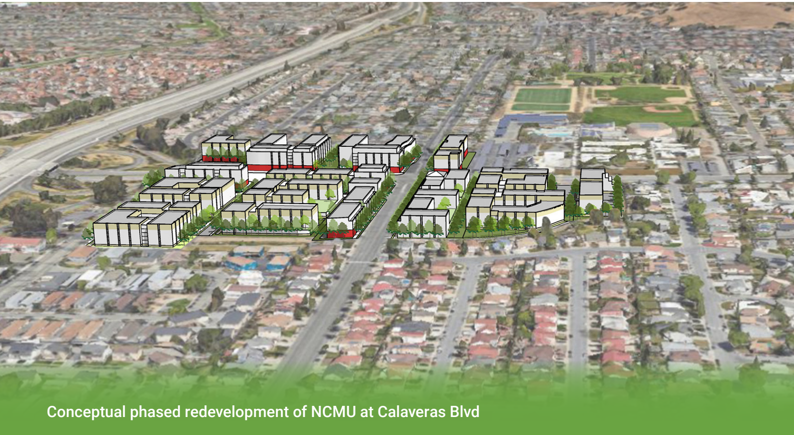
Conceptual phased redevelopment of NCMU at Calaveras Blvd

Neighborhood Commercial Mixed Use (NCMU)