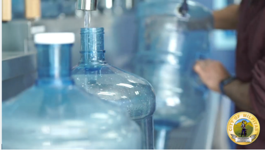
Milpitas Pure Water Website .

The City of Milpitas launched the Milpitas Small Business Spotlight Program to sustain and grow the local economy by supporting diverse businesses. The program is designed to assist small businesses affected by the pandemic through promotions and marketing. Learn more about our featured small business, Milpitas Water . You can access all the produced small business videos through the City's YouTube Channel , social media channels, and the City Website's Office of Economic Development page .