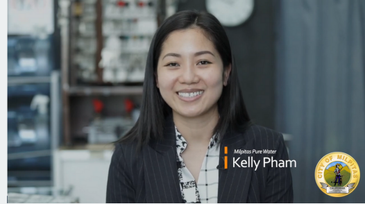
Milpitas Pure Water Video .