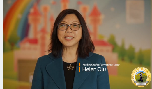
Rainbow Childhood Development Center Video .