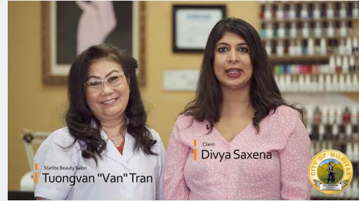
Starlight Beauty Salon Video .