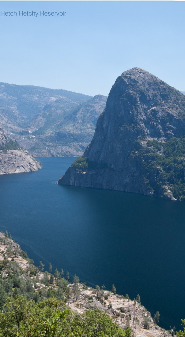
Hetch Hetchy Reservoir

The City of Milpitas draws water from two sources to provide clean water to residents and businesses. The water is purchased from two separate wholesalers: treated surface water from the San Francisco Public Utilities Commission (SFPUC) and treated surface water from the Santa Clara Valley Water District (SCVWD). In the event that water supply is interrupted from either SCVWD or SFPUC, the City has the option of utilizing its emergency supply to meet basic water needs for a short duration of time. In 2017, the City supplied an average of 6.8 million gallons of water per day to approximately 16,000 homes and businesses for indoor and outdoor use.