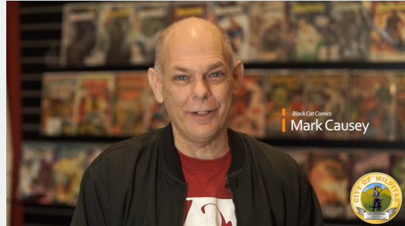
Black Cat Comics