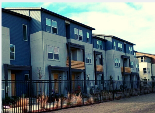
Tarob Court Townhomes located at 1980 Tarob Court (three-story building with 7 units) had one more building permit with 7 units finalized, bringing it to a total of 35 completed units out of 59 units in the development.

A number of businesses were issued building permits recently and they will begin work at their facilities soon. Safeway will be improving its store at 555 E. Calaveras Blvd. A variety of manufacturing and technology companies such as KLA, Headway Technologies, and WestRock (a packing company) will be performing tenant or site improvements at their facilities.