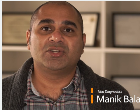
Isha Diagnostics https://bit.ly/3mEywhN (promo video link)