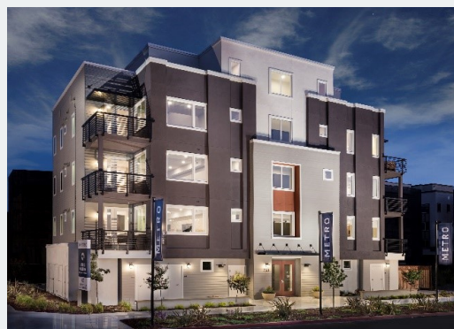
Metro Flats is a 108-unit residential development at 1401 S. Milpitas Blvd. With the last four-story building with 6 units completing all work and finalizing its building permit, the project has completed all 108 units in the development.