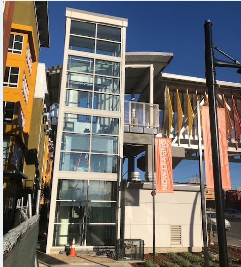
Future site of Montague Pedestrian Overcrossing mural

The artwork will grace the ground level walls of the new pedestrian bridge over Montague Expressway, connecting the Milpitas Transit Station parking garage and BART Station with the surrounding Milpitas Metro neighborhood and Great Mall. With hundreds of visitors and residents expected to pass by daily, it will be among the City's most visible public artworks. The commission for this piece is $15,000, funded entirely through developer contributions to the City's Public Art Fund. Proposals are due January 11.