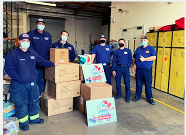
Fire crew with boxes of toy give-aways for Milpitas children

Usually, toys are given out at the Milpitas Community Center. However, due to the stay-at-home orders, the Fire team delivered the toys to the families' doorstep, with off-duty personnel supported by a fire engine stopping by to provide some holiday cheer. This year, Milpitas Fire was also supported by members of the Spring Valley Volunteer Fire Department, who had received a donation of toys and made sure to spread the holiday cheer.