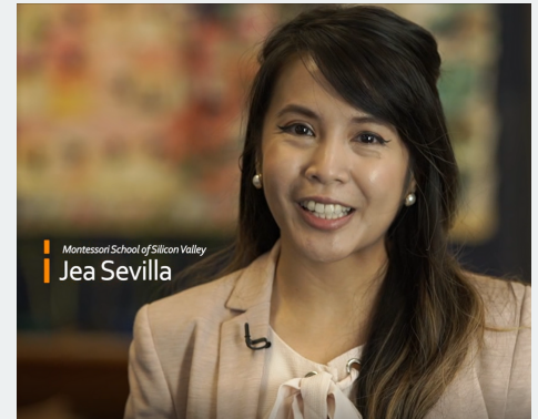
Montessori School of Silicon Valley https://bit.ly/3hazH7i (promo video link)