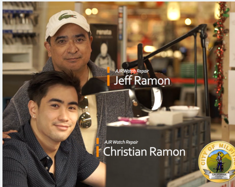
AJR Watch https://bit.ly/3awnGba (promo video link)

The promotional videos will be shared through the City's social media channels to support the local small business community in these challenging times.